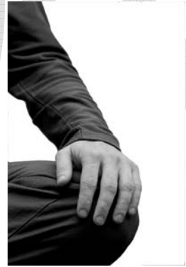
resting on the knees

They are conducive to meditation because they allow for proper positioning of the shoulders, while encouraging good posture and a feeling of stability and centeredness.