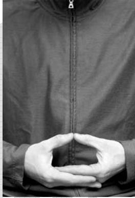
in a circle over the abdomen